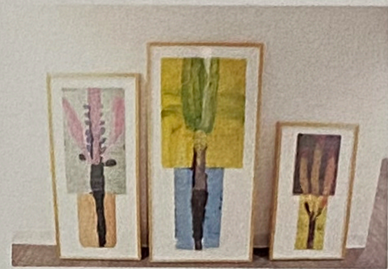
Gary Komarin , New York, New York Untitled (Trees Rising Series) , 1999 Mixed Media 24" x 50"; 19" x 34"; 20" x 44"

Greater Des Moines Partnership Collection