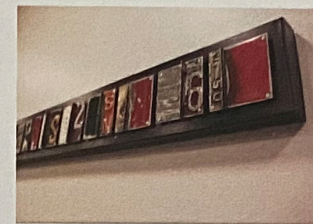
Anthony Hansen , Morro Bay, California Series , 2016 Found Automotive Sheet Metal, Scraps, Signs, License Plates 7" x 62" x 2"; 7" x 82" x 2"

Greater Des Moines Partnership Collection