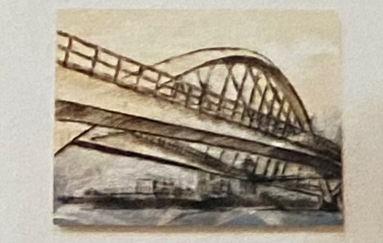
Benjamin Frey , Buena Vista, Virginia Across the Horizon , 2015 Watercolor Pencil, Acrylic Paint, Inks, Graphite, Pastels and Antique Collaged Papers on Hardboard 36" x 48"

Greater Des Moines Partnership Collection