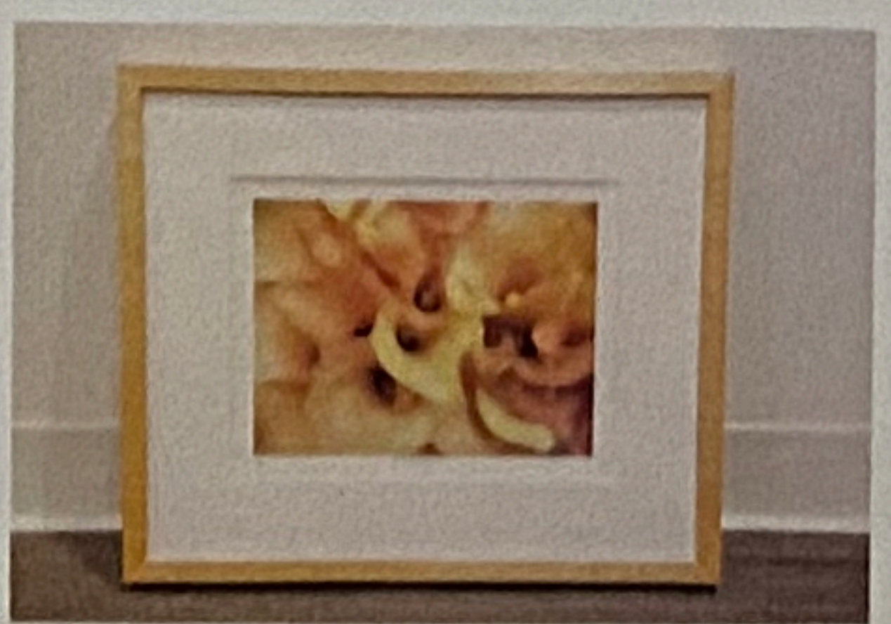
Bill Luchsinger , Macksburg, Iowa Photography Pink Callas – AP, 1999, 17" x 20" Callas – AP, 1999, 17" x 20" 4 Yellow Callas , 1999, 17" x 20"

Greater Des Moines Partnership Collection