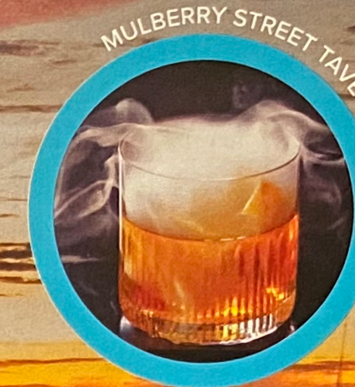
MULBERRY STREET TAVERN

—DAVID BYRNE, ROCK AND ROLL HALL OF FAME INDUCTEE