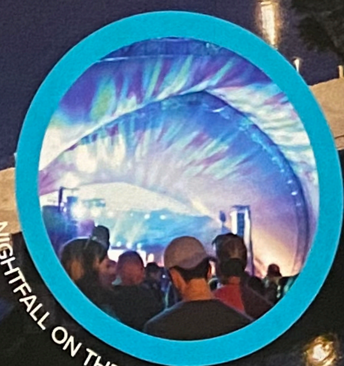
NIGHTFALL ON THE RIVER

WELCOME TO DES MOINES, IOWA. LOCATED IN THE MIDDLE OF THE HEARTLAND, BUT FAR FROM MIDDLE OF THE ROAD. WE THINK YOU'LL LOVE IT HERE, BUT DON'T JUST TAKE OUR WORD FOR IT. OUR HUMILITY MAKES US IOWA NICE, BUT WE'VE GOT FANS WHO SING OUR PRAISES.