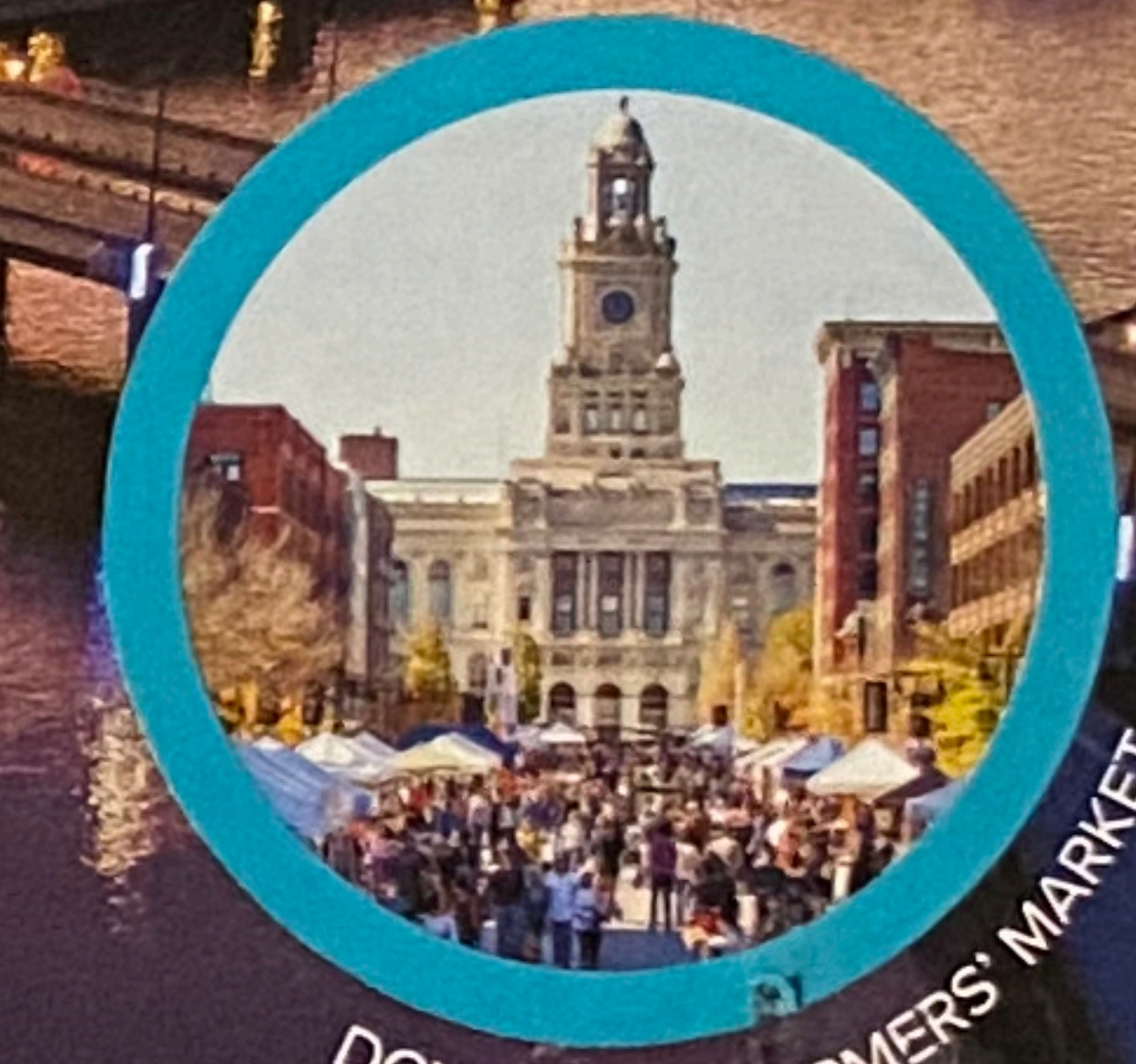
DOWNTOWN FARMERS' MARKET

“DES MOINES IS THE BEST SITE I'VE EVER BEEN A PART OF.” —NBA HALL OF FAME REGGIE MILLER