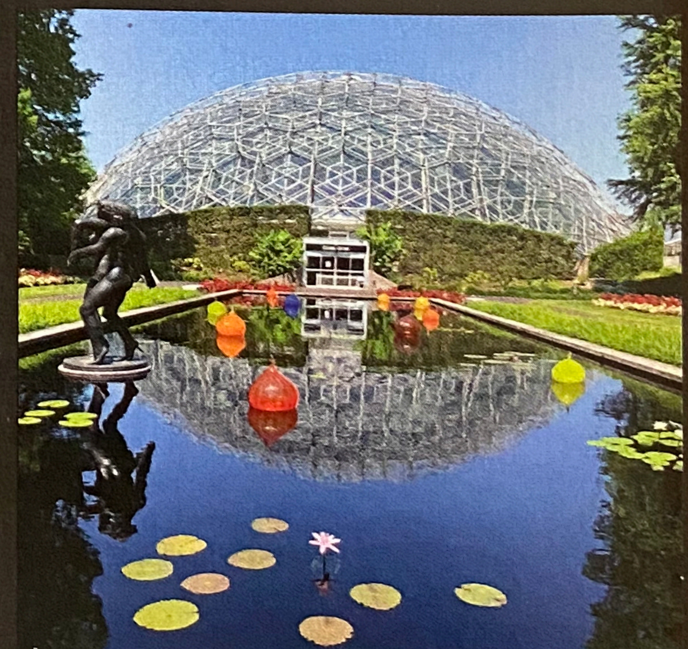
REFLECTIONS Missouri Botanical Garden, St. Louis