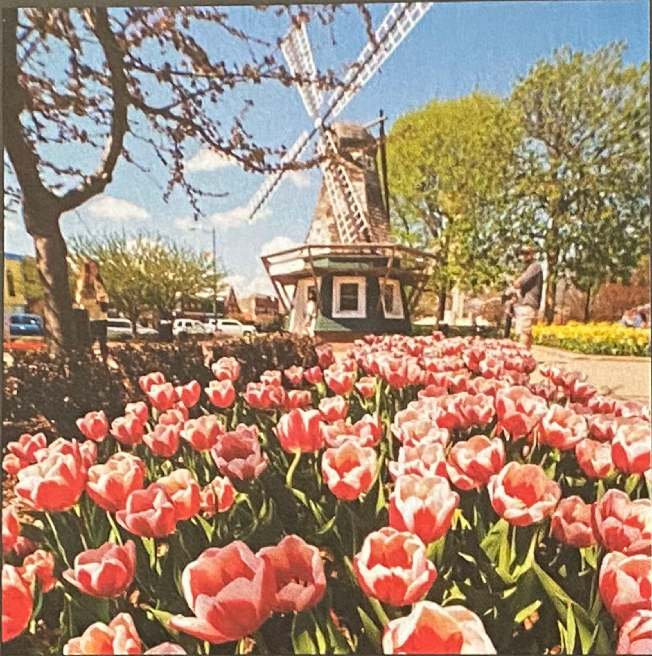
TULIP TIME Pella, Iowa

#midwestmoment SHARE YOUR INSTAGRAM PHOTOS WITH US!