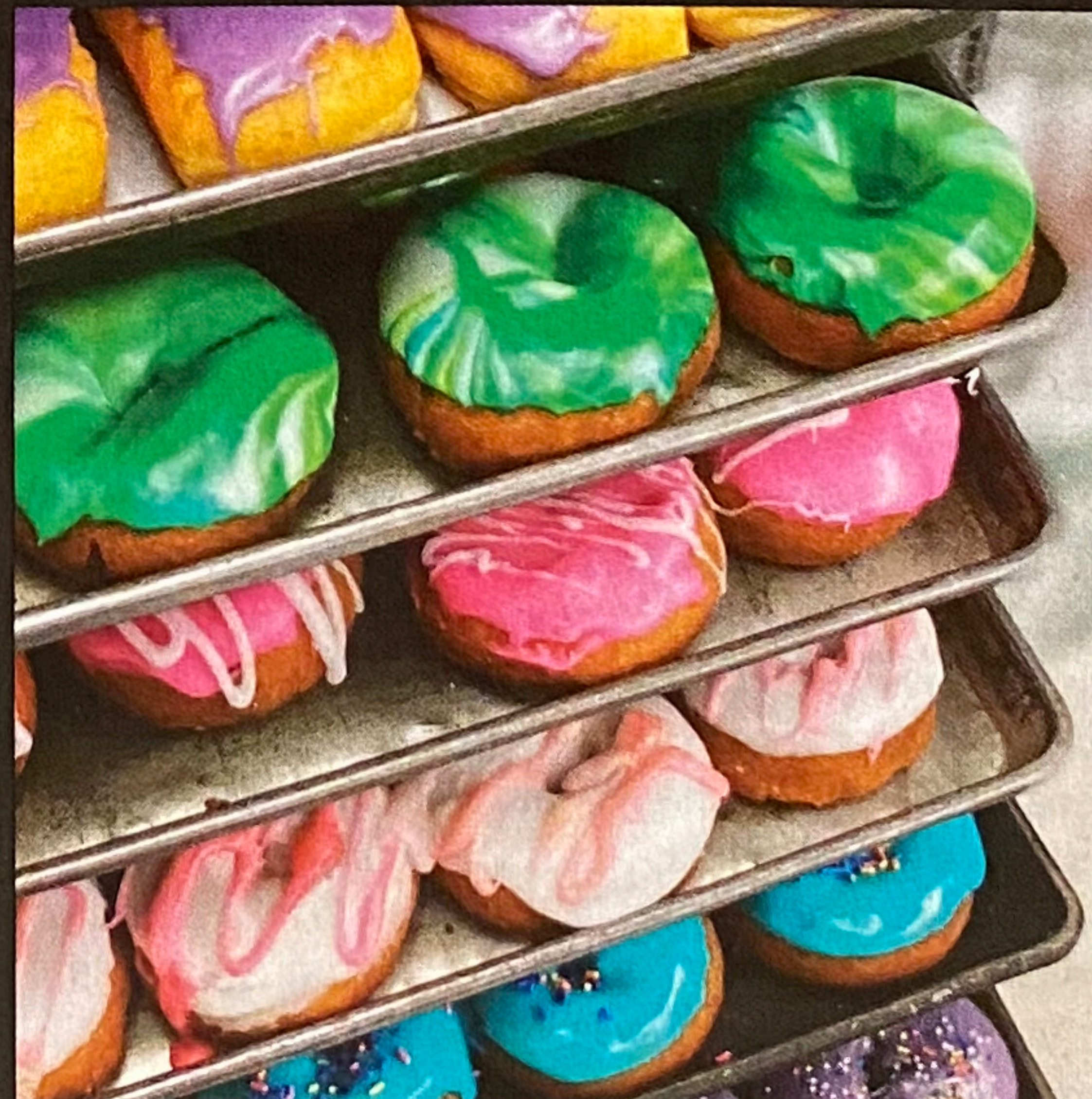
RAINBOW TREATS North Judson, Indiana