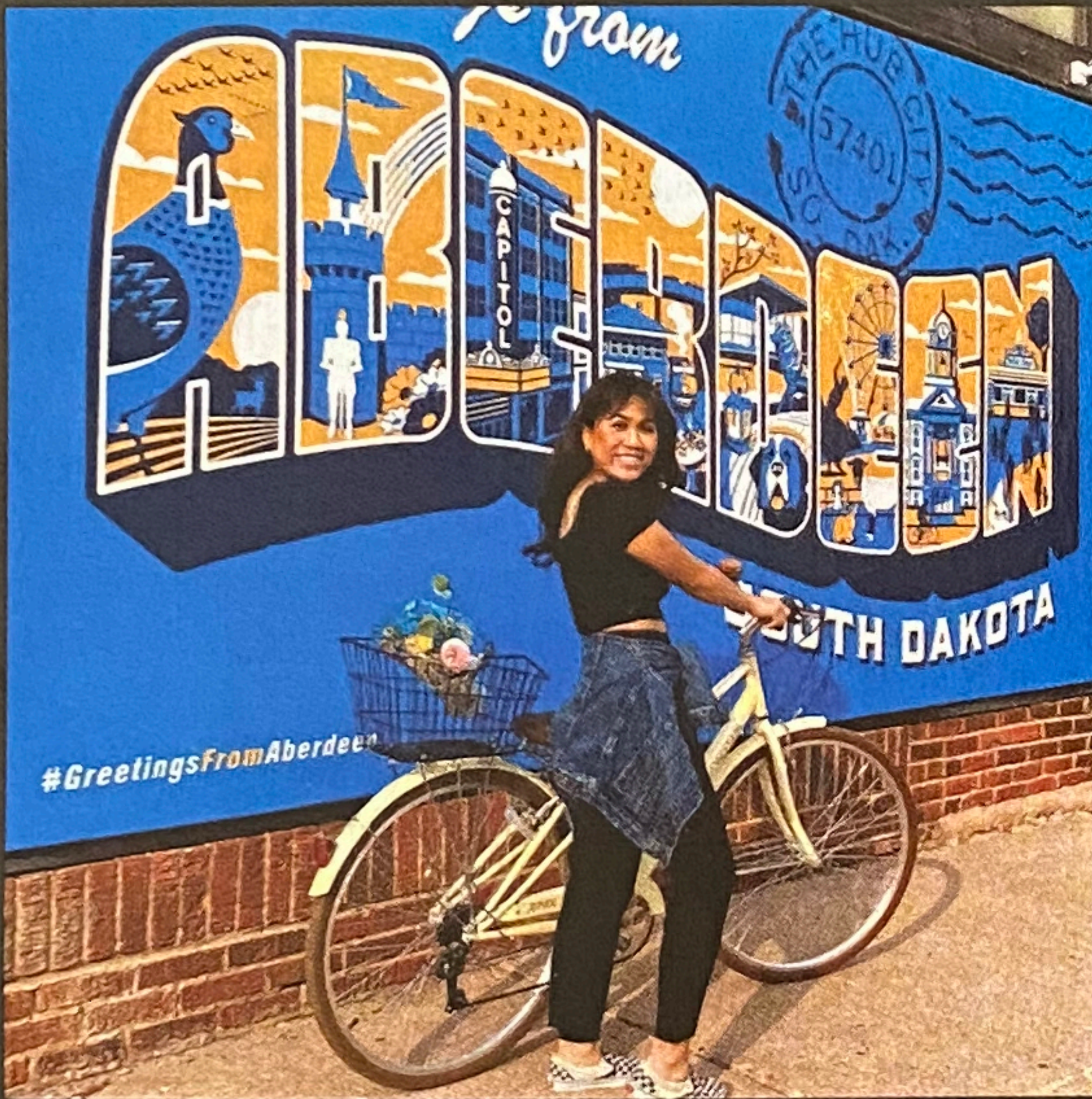
ROLL WITH IT Aberdeen, South Dakota