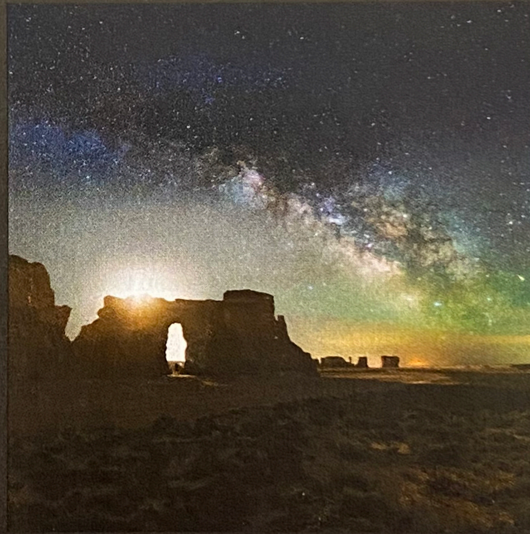
STARSTRUCK Monument Rocks, Kansas