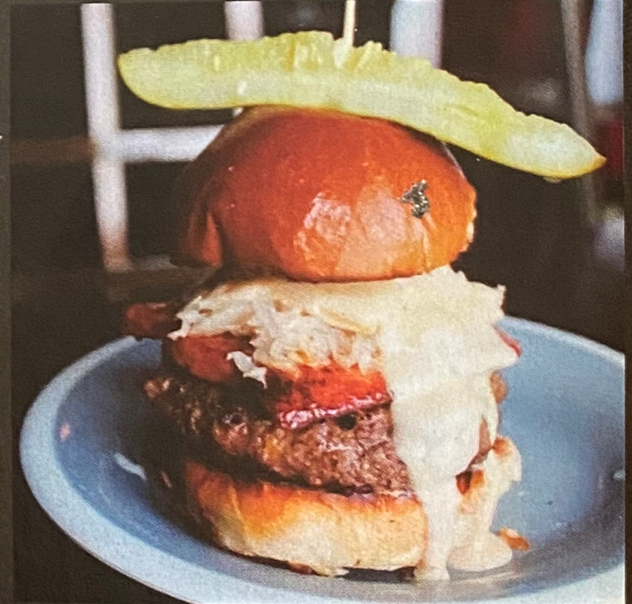
TOWERING BURGER Cleveland