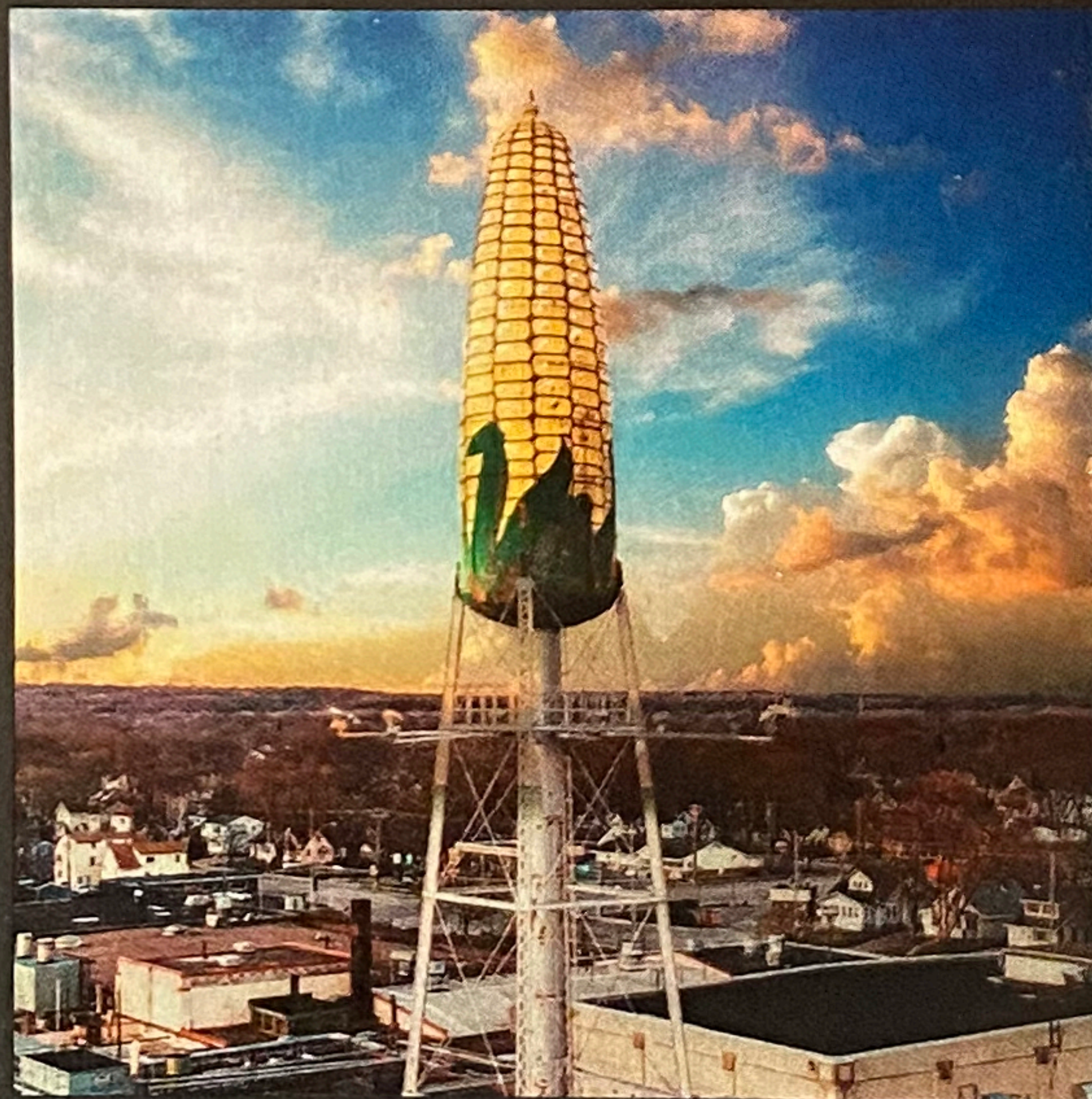
A-MAIZE-ING Rochester, Minnesota