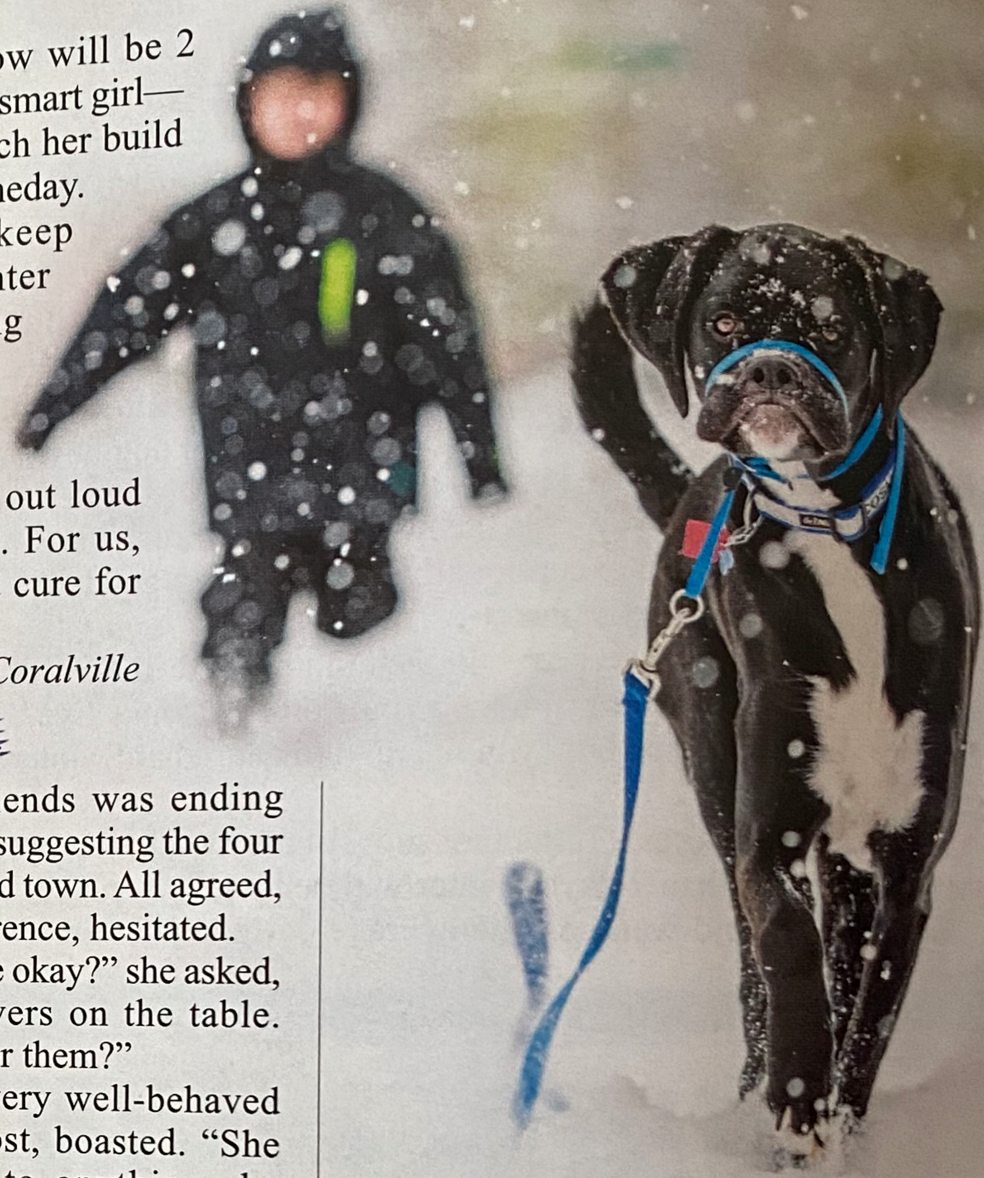
THE SNOWFALL was too much thrill for this dog to stay with his walker—he just had to run!