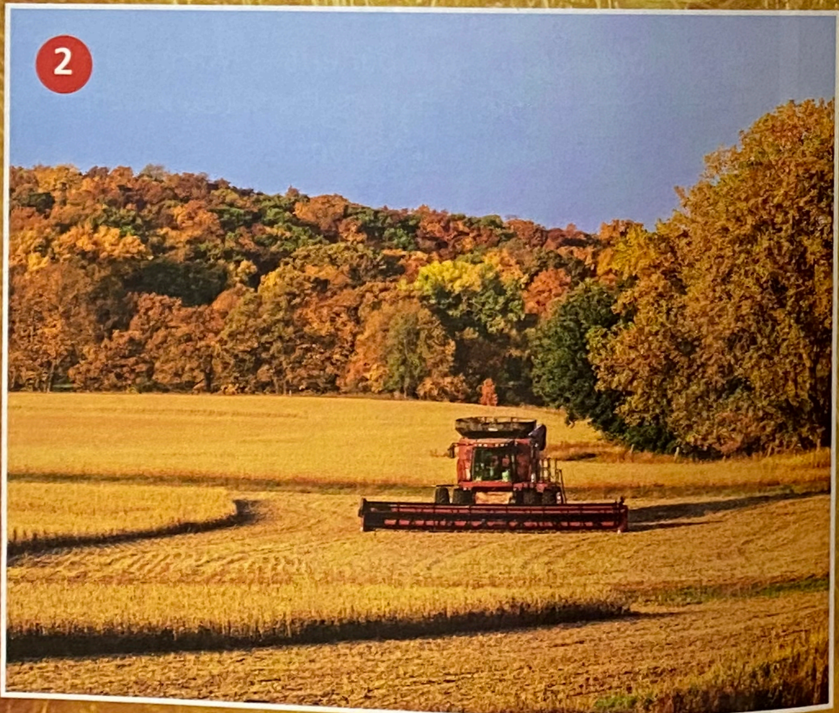
2 COMBINING THE CONTOURS. Abundant sunlight fell over this sculptured field and caught the eye of Terri Dermody of Des Moines. “I was out in Guthrie County and just had to stop for this photo. I loved the way the backdrop of autumn colors surrounded the bright red combine ready for another harvest.”