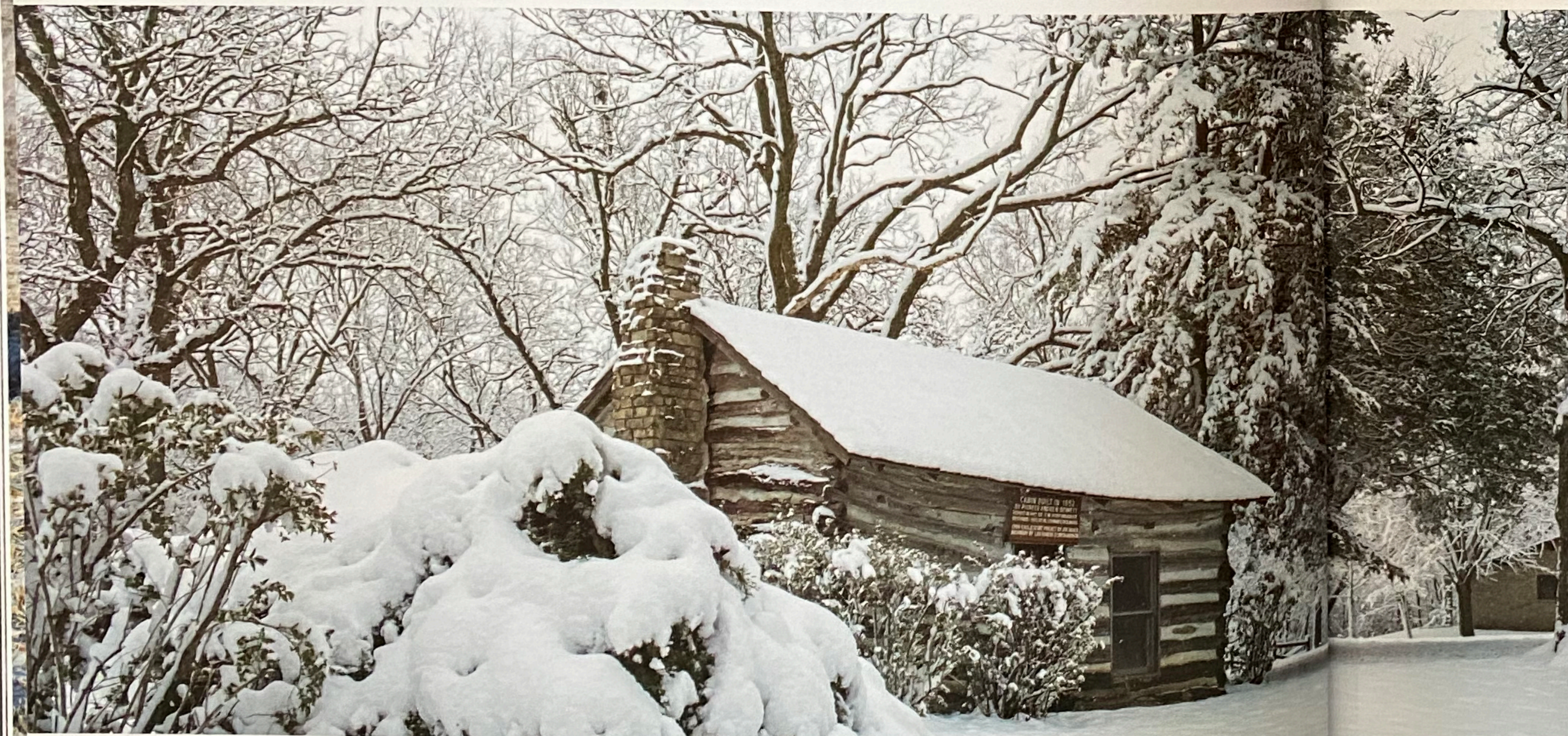
Top: Manning is one of Iowa's small towns that still displays its Christmas tree in center of an intersection of streets. Above: The Bennett log cabin wears a fresh layer of snow at Winterset City Park in Winterset.