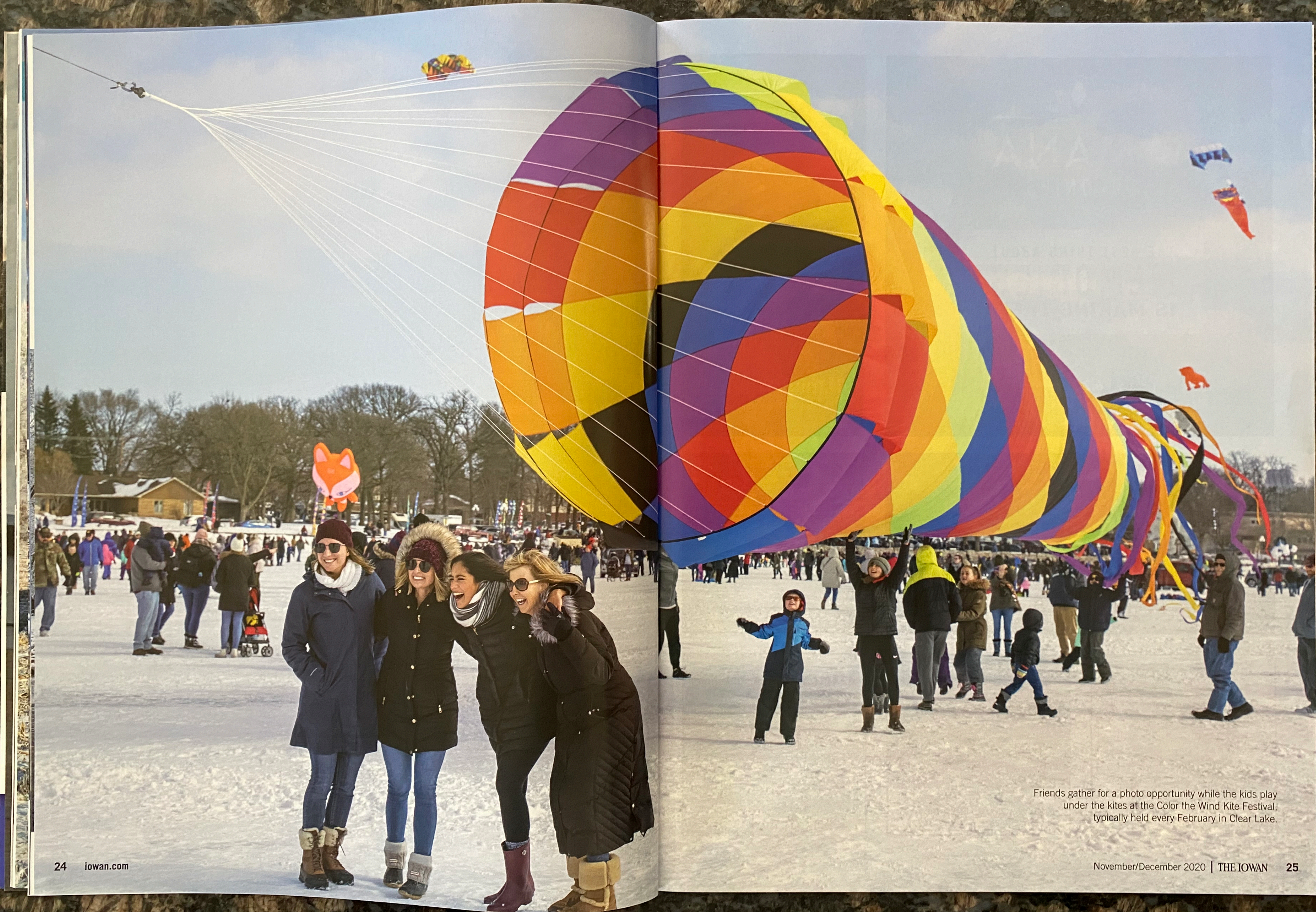
Friends gather for a photo opportunity while the kids play under the kites at the Color the Wind Kite Festival, typically held every February in Clear Lake.