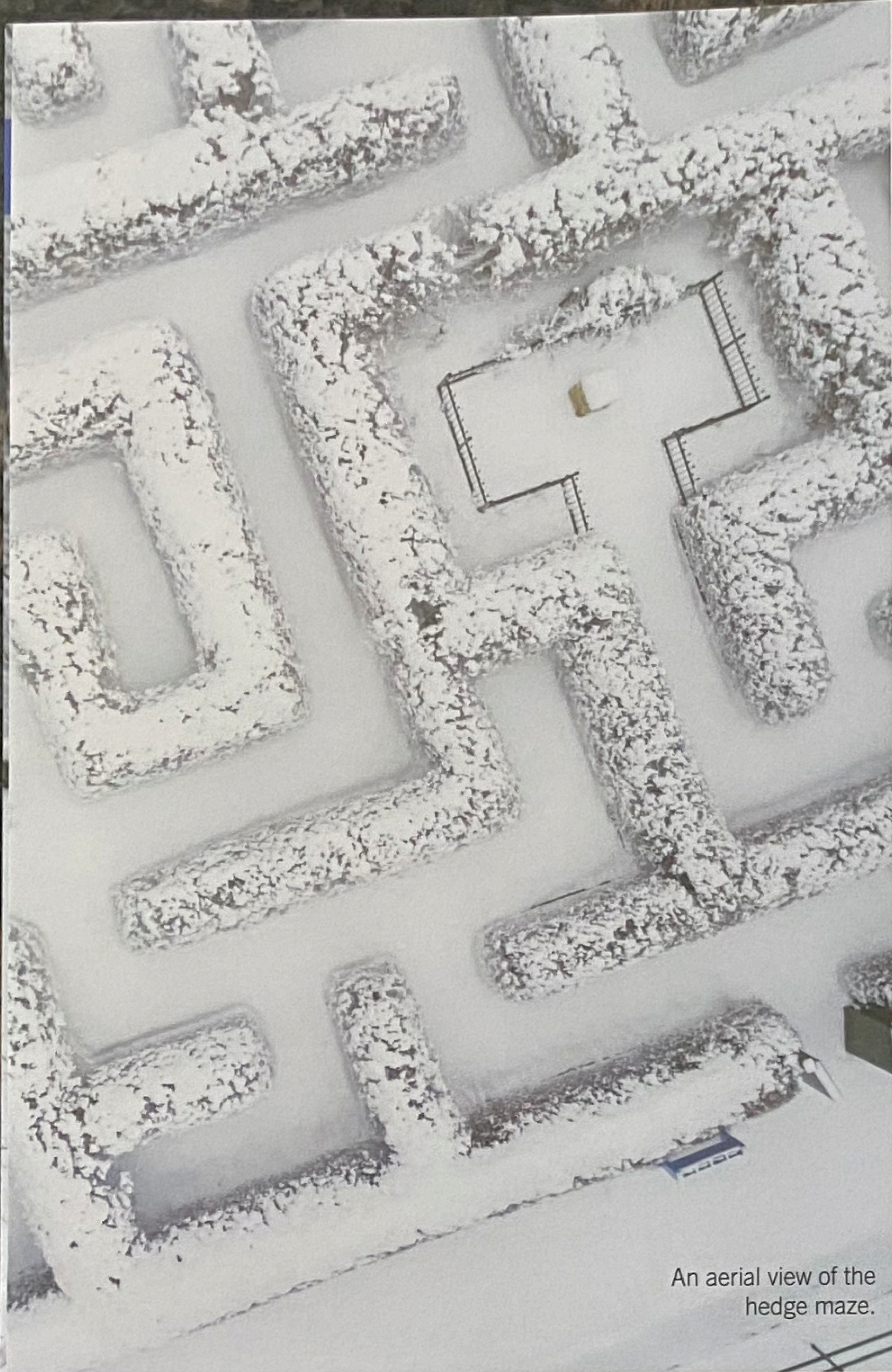
An aerial view of the hedge maze.