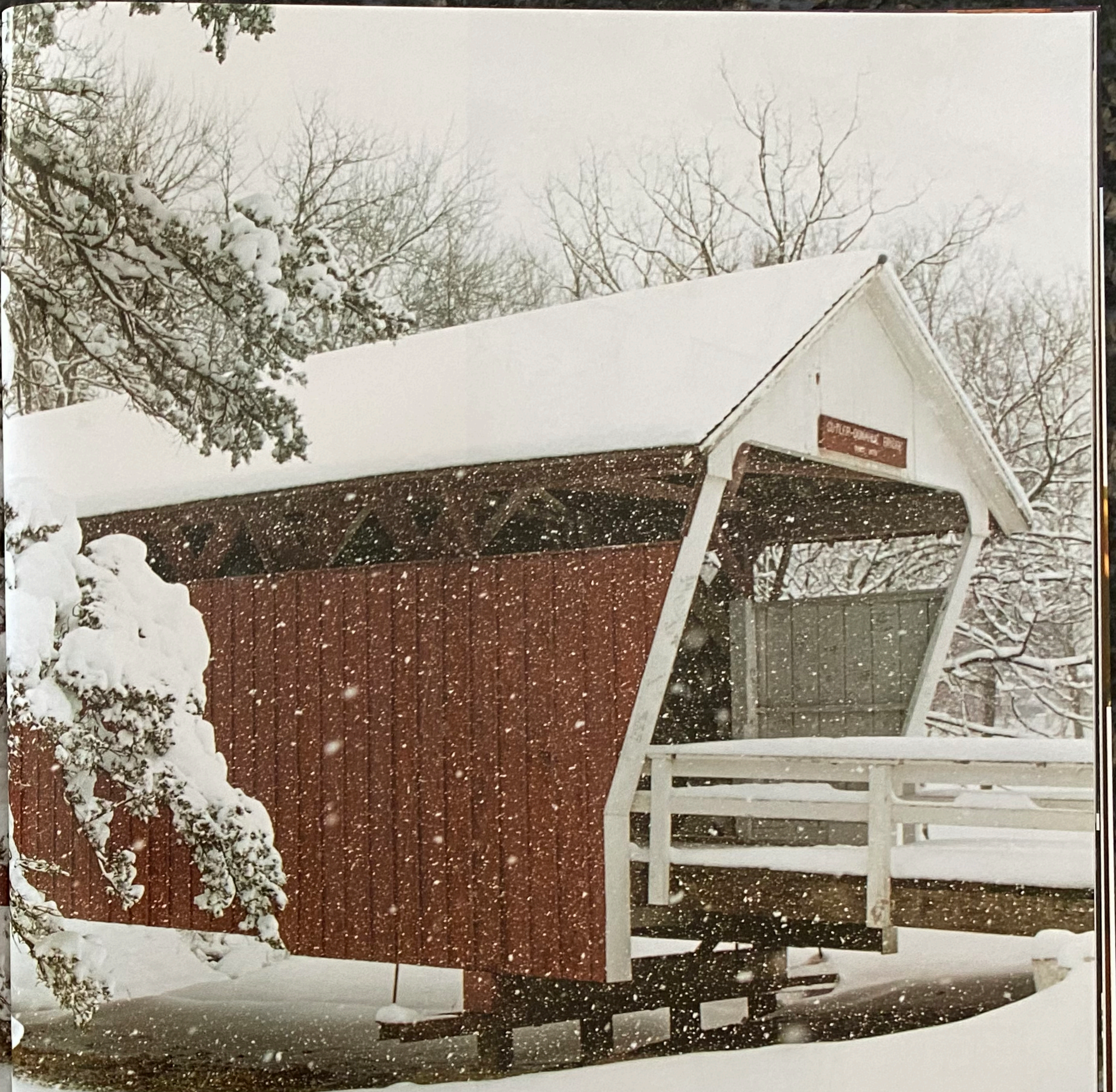
Cutler-Donahoe is one of just six covered bridges in Madison County.