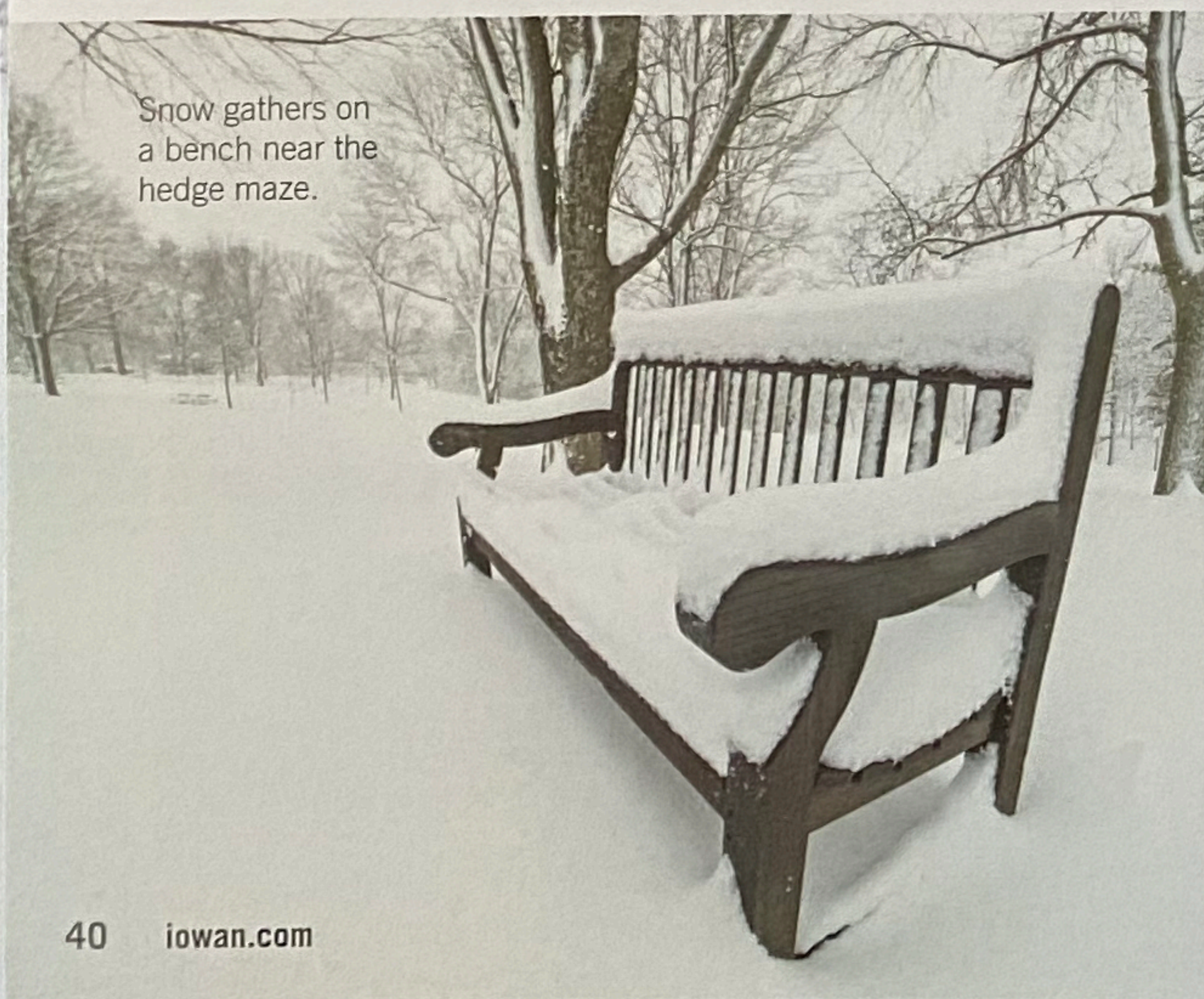
Snow gathers on a bench near the hedge maze.