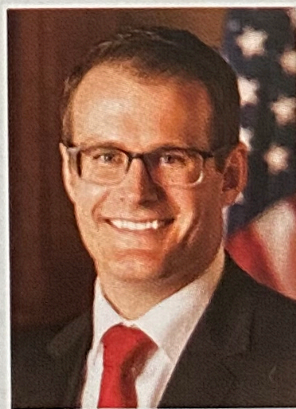
Kim Reynolds Governor of Iowa