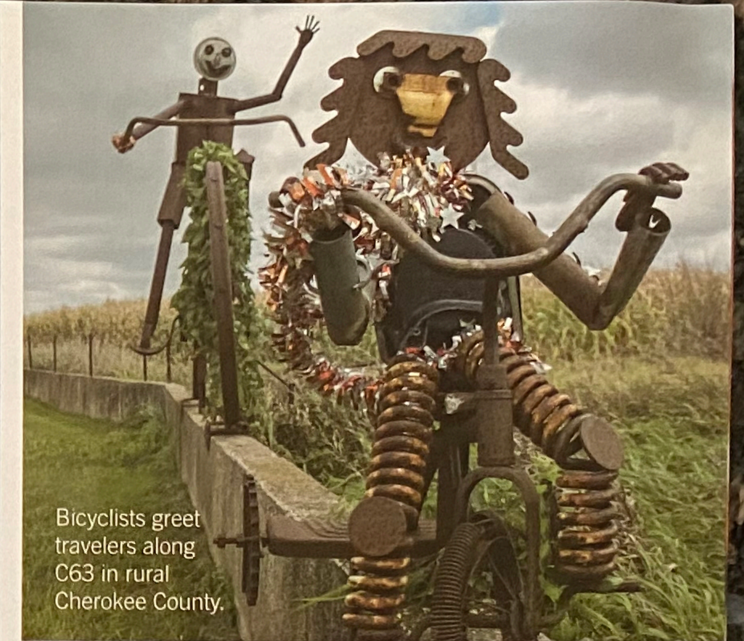
Bicyclists greet travelers along C63 in rural Cherokee County.