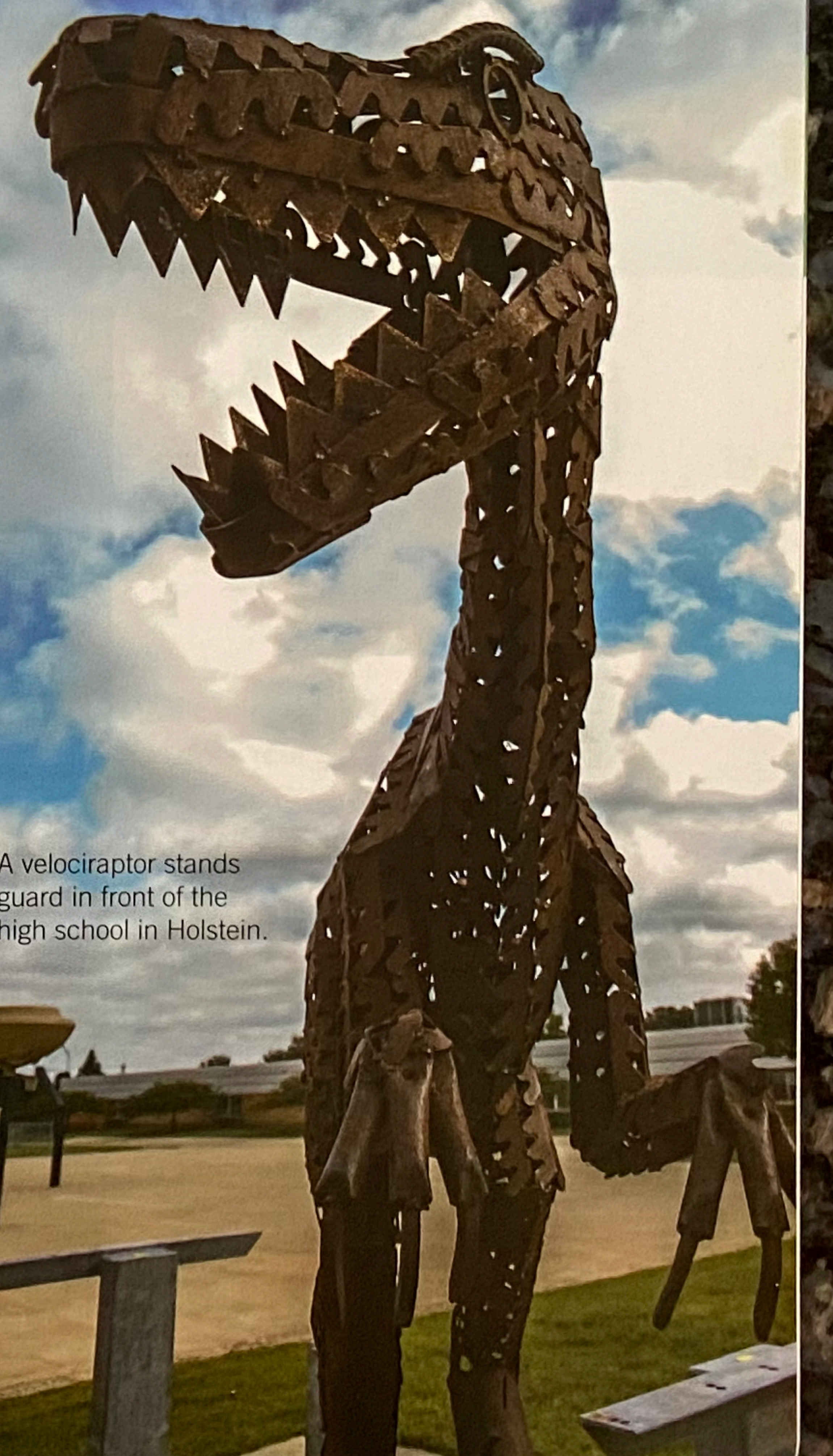
A velociraptor stands guard in front of the high school in Holstein.